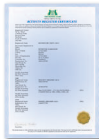
Certificate with your dogs details